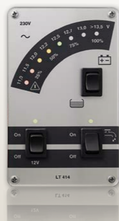
12-volt power supply package