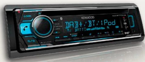
Radio DAB+/CD/MP3 with USB and Bluetooth