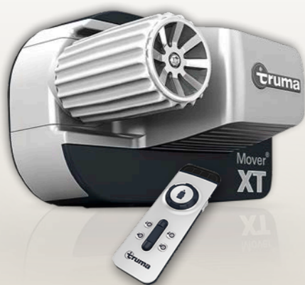
Truma Mover® XT