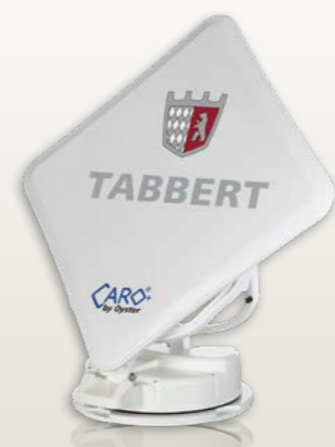
Antenna package CARO®+