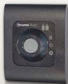
Remote display DuoC (integrated anti icing)